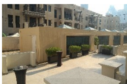
Take a break right outside!