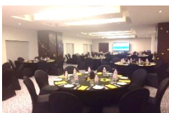
Meeting room format