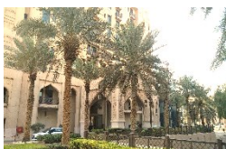
The Heritage Hotel Exterior

Located on the Mezzanine floor the meeting room is equipped with advanced audio-visual equipment and wireless connectivity. Refreshments and lunch are served immediately outside the room with access to an outdoor terrace.