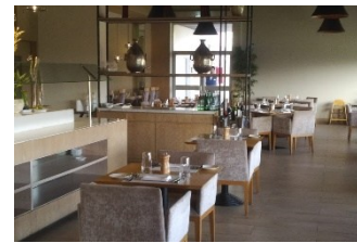
Jeema Restaurant dinner venue