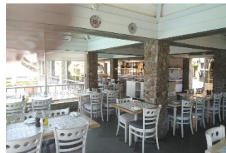
Gazebo lunch venue