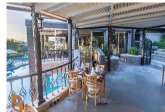
Prior Evening Reception venue