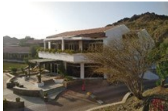
Self-contained conference centre

Refreshments during the day will be available immediately outside the entrance to the plenary meeting room and can be taken onto the terrace