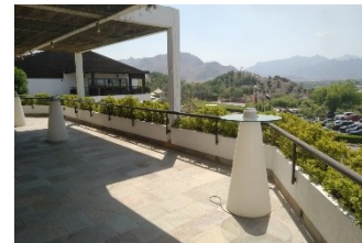
Plenary room terrace