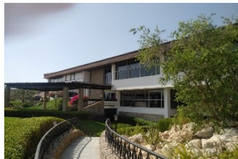
Hotel front entrance

This boutique hotel has a total of 77 rooms, all self-contained and set in two single storey wings linking to the main hotel facilities.