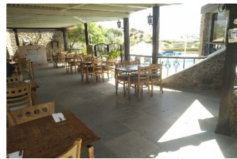
Gazebo outside terrace