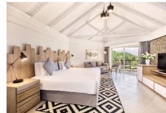
Deluxe rooms all with mountain views