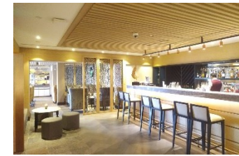
Roudoul cocktail bar