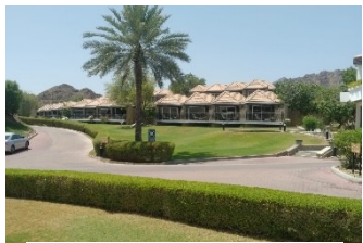
Dedicated accommodation wing