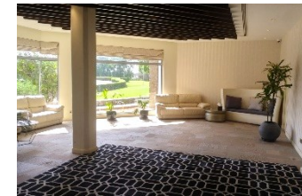
Breakout and discussion area